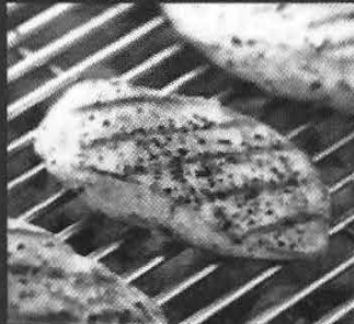
Chicken Breast Filets

Over 350 delicious foods delivered right to your door.