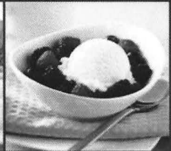
Vanilla Ice Cream and Triple Berry Blend